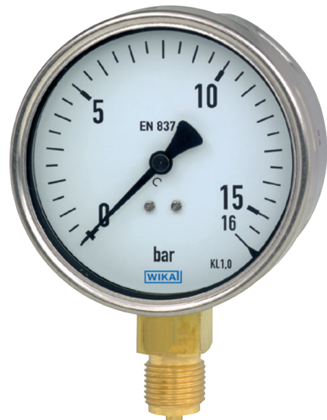
Bourdon tube pressure gauge model 212.20