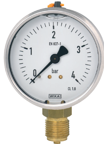
Bourdon tube pressure gauge model 113.53