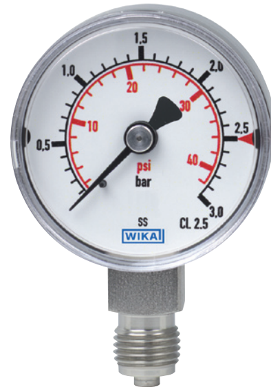
Bourdon Tube Pressure Gauge Model 131.11.50 with 2nd scale psi